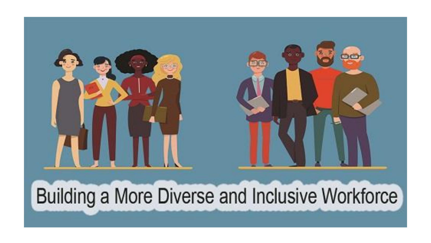
Staff Equalities Network – 'The Story So Far' October 2021